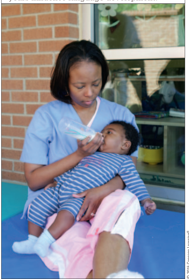
Photo 1-3 Care and attention in the early years influence language development.